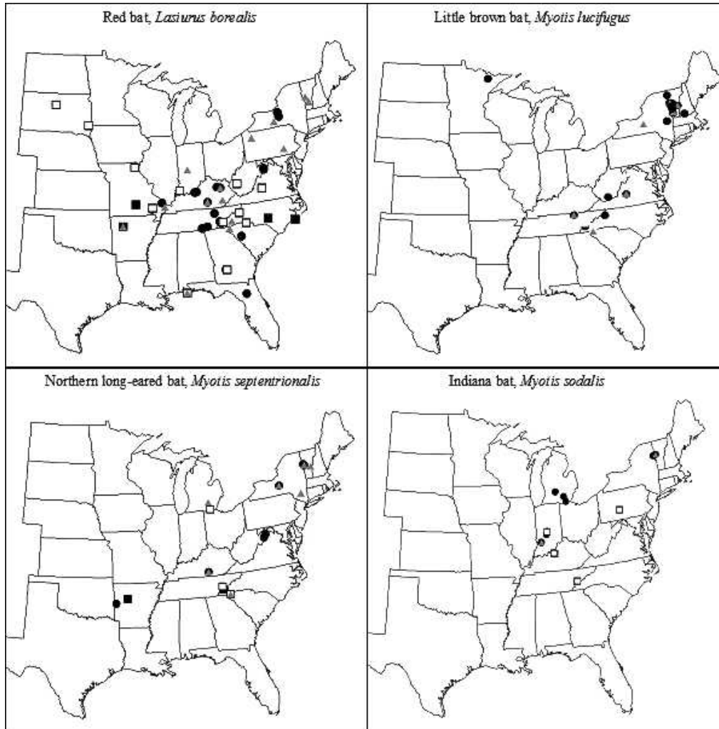
FIG. 1.—Sampling locations for each of the 4 species examined. Circles represent sites where adult females were sampled, triangles represent sites where adult males were sampled, and squares represent sites where juveniles were sampled.

female M. lucifugus also differed significantly from that of adult female M. septentrionalis . The slopes for adult female M. lucifugus also differed significantly from the slope for L. borealis . Similar differences occurred when using \delta D_{pB} as the predictor. The slopes and intercepts for adult male L. borealis differed significantly from those for all other species for both predictors (Table 2).